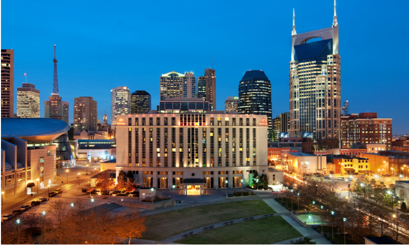
Downtown Hilton hotel